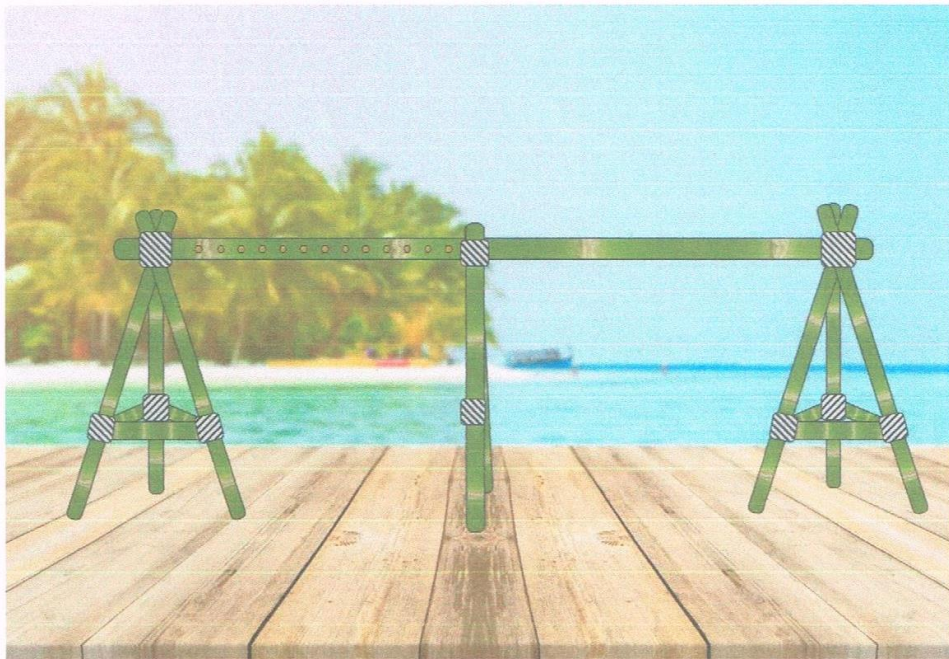
Modified Solar Drying Method Height: 2 meters Length- 7 meters