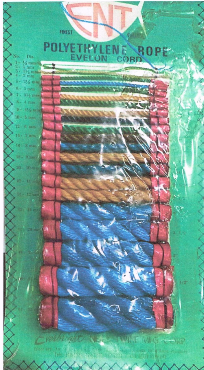
200 meters per roll