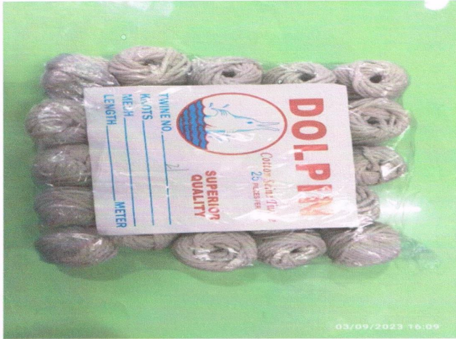
COTTON SIENE TWINE NO. 21 1 PACK=25 ROLLS @10 METERS PER ROLL